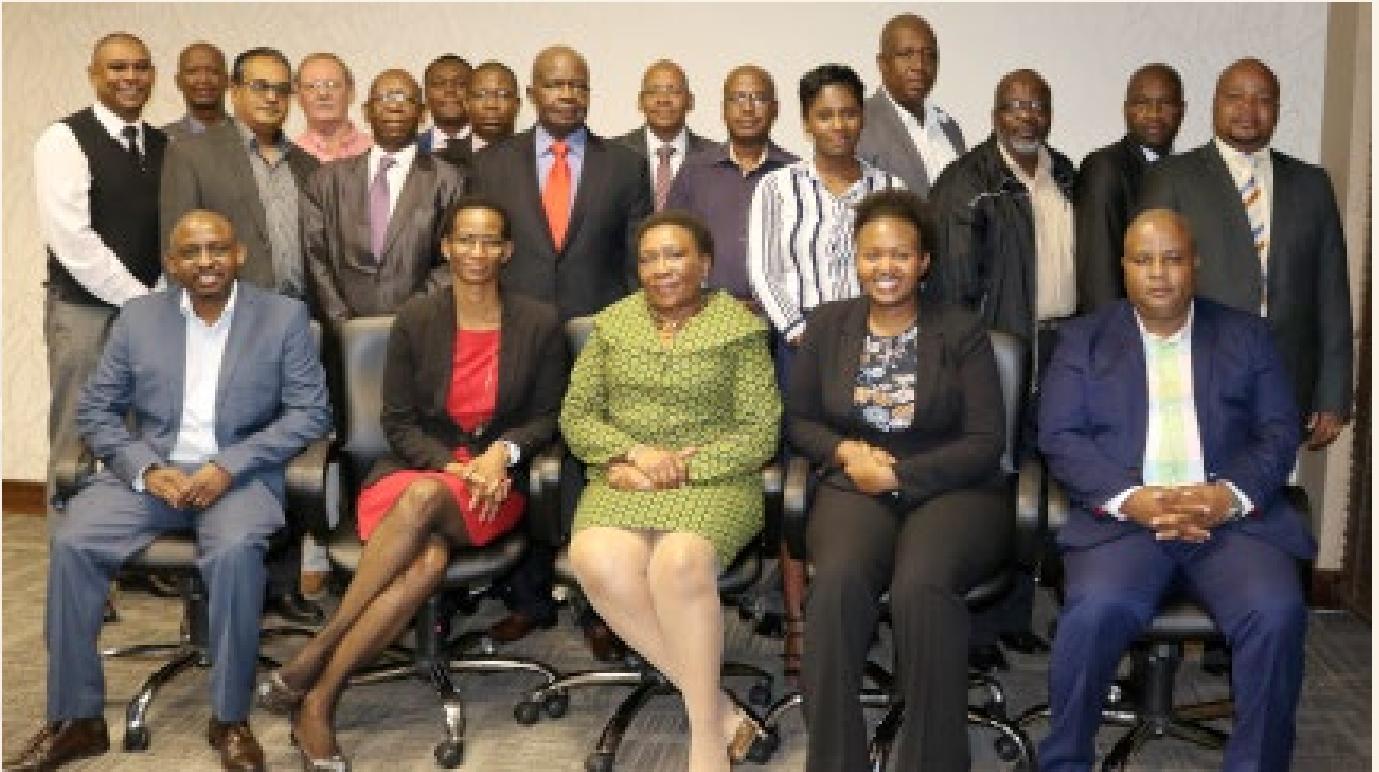
The panel of experts at the methodology workshop held earlier this year.

PSiRA hosted a methodology workshop with a multidisciplinary panel of experts on transformation on matters relating to the private security industry in Centurion on 12-13 April 2017.