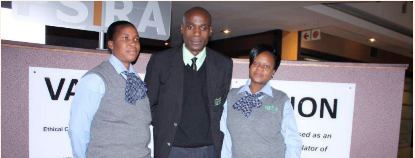
Private security officers are to learn more about human rights.

As the country will be commemorating Human Rights Month in March, PSiRA has embarked on building a curriculum that talks about human rights to security officers.