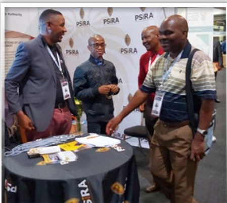
Left: The exhibition stand at the summit.

Platforms like the UCLG Summit is able to showcase the cities to the world and PSiRA has been able to be part of the world stage.