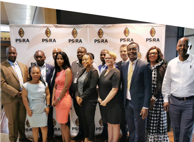
PSiRA Executive Members with CSOS delegates

We were delighted to outline different aspects that ensure the smooth running of our regulator and point out the challenges that CSOS should be aware of that would assist in decision-making on critical issues. In this regard we have gained a valuable stakeholder with whom we will work hand-in-hand to ensure compliance.